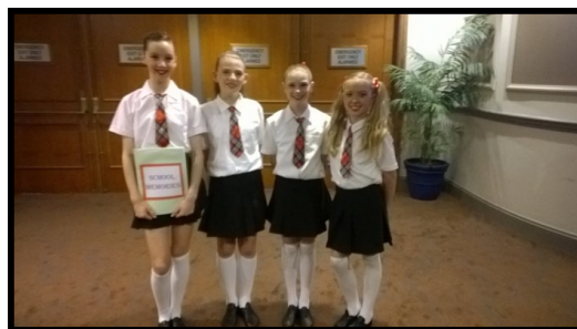
Year 6 Dance Group