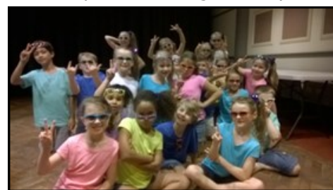
Year 2 Dance Group

On Monday 27 th October, six performing groups from Kororo took the stage at the Lighthouse Community of Schools Concert. The night showcased a variety of acts from Kororo PS, Narranga PS, Tyalla PS, Coffs PS, Orara HS and Coffs HS. Our talented groups included "Thriller", "Abba" and "Black or White" from the Stage 3 Showcase, the Year 2 Dance Group and a Year 6 Experimental Dance Group. This dance was made up of four Year 6 girls who were guided through a process of student-directed choreography. It was a trial of technique that encourages input from students and follows a "story". They all did a fabulous job and it was another great opportunity for our students to perform. A huge thank you to all the teachers and parents who supported this event!