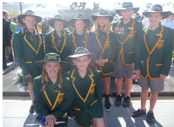
Some of our School Representatives at the Anzac March last week.