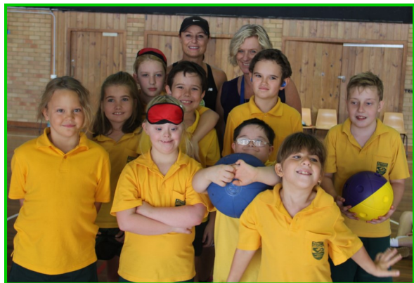
Our "Kororo Kool Kids" have a fun and enthusiastic day learning GOALBALL, hosted by Orara High School.